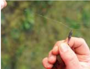
Feeder slides in the loop offering little resistance to a taking fish. A light bobbin will then rise