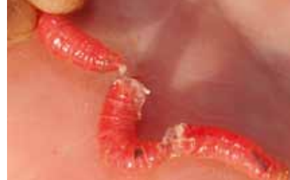
Repeat the glueing process with two more maggots to create a long string of grubs