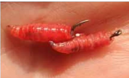
This leaves room for another maggot to be lightly hooked so the hookpoint is clear