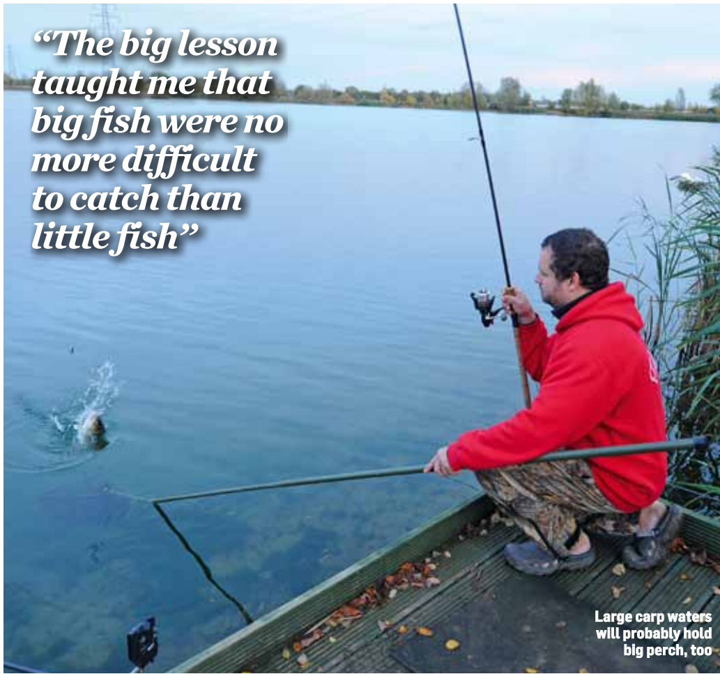
Large carp waters will probably hold big perch, too

"The big lesson taught me that big fish were no more difficult to catch than little fish"