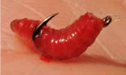
Tease the grub round the bend and poke the point out of the side. Shank is covered