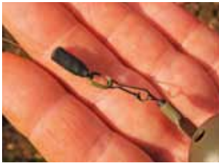
Feeder goes on an Enterprise Tackle Snag Safe Lead Clip that releases the rig if feeder snags