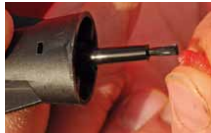
For an extra large hookbait moisten the fat end of a maggot then paint with superglue