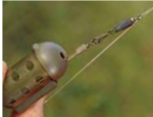
Feeder goes inside a figure-of-8 loop (see left) with a second loop below it to hold the hooklink