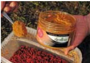
There are a four varieties of spices in the Quest Baits range of Braddock's baits. Shaun uses Xotic Spice for perch