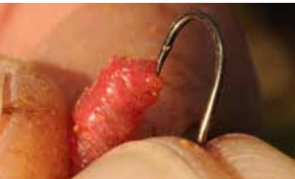
Offer up the blunt end of the maggot to the hookpoint and sink the point into the bait

One of his most lauded creations was a blend of more than 20 powdered spices and essential oils called Xotic Spice – a curry-like