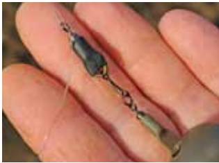
Cover the clip with silicone tubing to stop the swimfeeder becoming dislodged on the cast