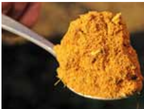
Xotic Spice is a curry-style blend of over 20 spices that will flood the water with different tastes and smells