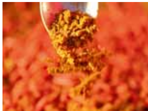
Add two heaped teaspoons of Xotic Spice to each pint of maggots the night before fishing. A 100g tub costs £6.99