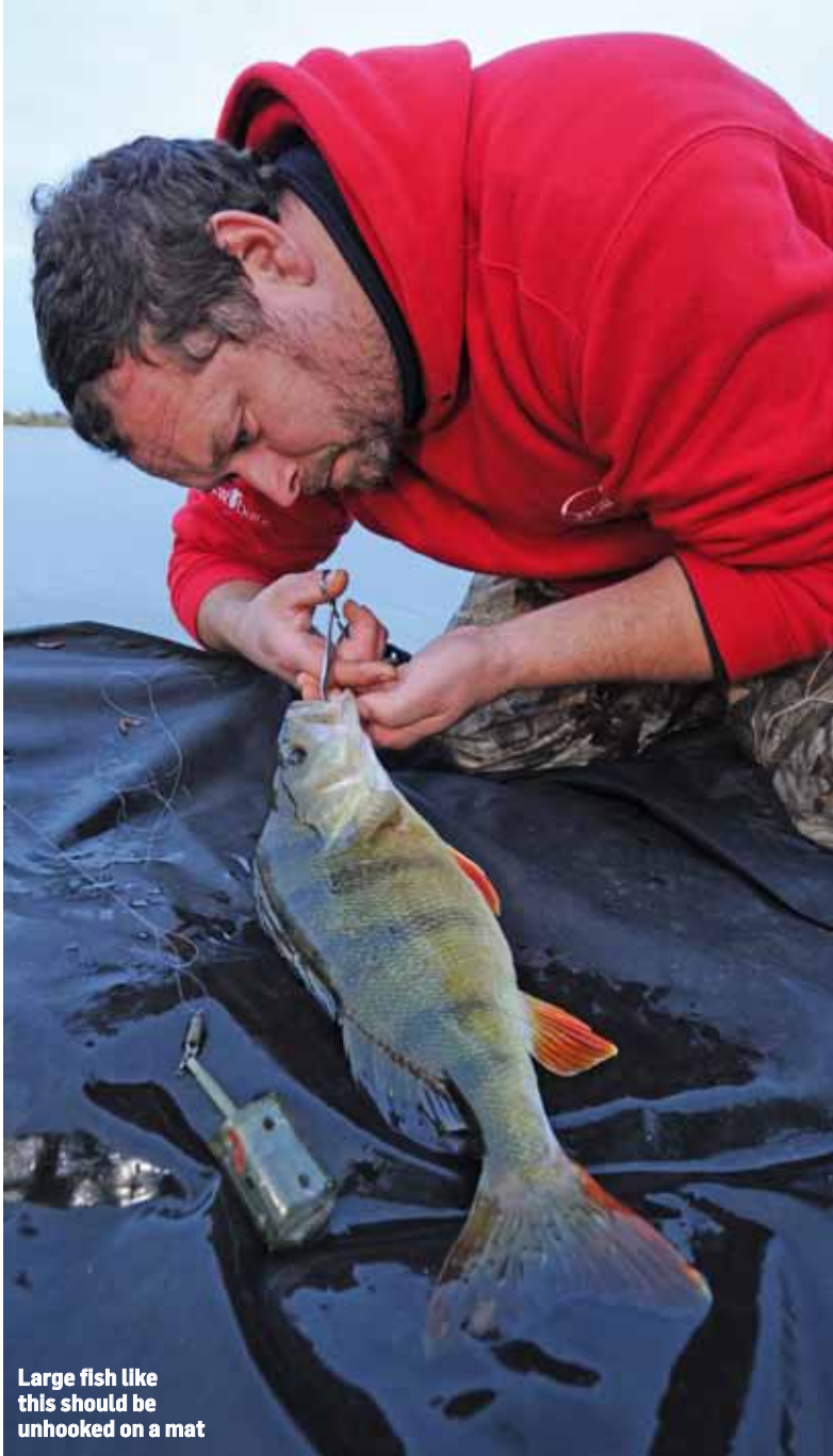
Large fish like this should be unhooked on a mat

Buy the fishing book of the year! Special offer – P91