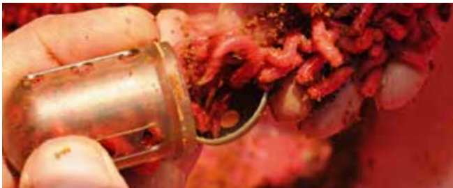
Maggots coated in Quest Baits Xotic Spice are packed inside a block-end feeder. Once cast out they pump out a slick of spicy flavours which perch adore. All you need to do is dust the grubs with the spice

lightweight bobbin rising smoothly to the rod as a perch made off with his bait. It was a bold bite and from the second Shaun lifted into it he knew it was a lump.