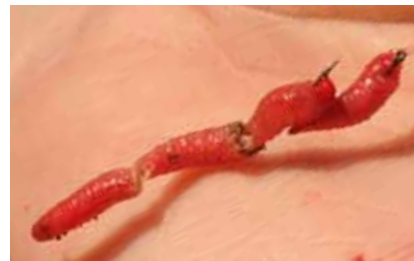
Thread one maggot up the shank then add the string of three superglued maggots